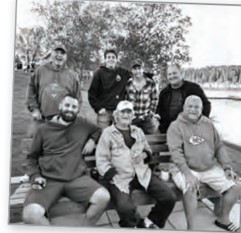
The Smoker's Bar...aka Gold Arrow fire pit. Grab a cigar or pipe and your favorite beverage and join the fun.