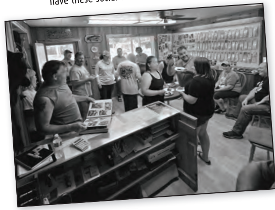
Dessert night is always a hit but this particular week everyone showed up at the same time. Such a bonus to have these social times attended so well.