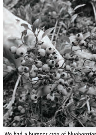
We had a bumper crop of blueberries and raspberries this year. Great spring and summer with perfect rainfall each week. Been a while since we've seen berries in these numbers