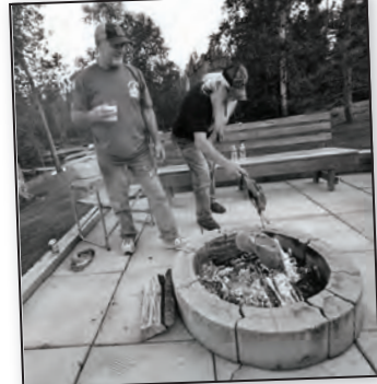
First time ever we had a Hat Burning ceremony in camp. Next year, who knows, maybe the ladies will burn their bras.