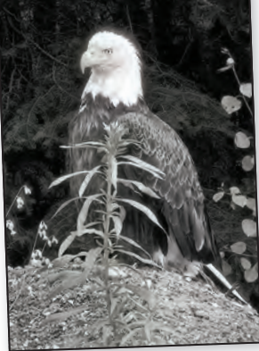
Beautiful eagle posing so nice for this candid shot!